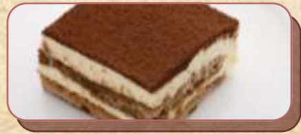
Homemade Tiramisu 1 Tray / 15 pieces $49.00