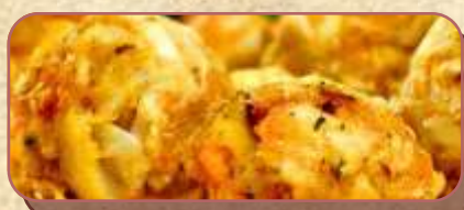
Crab Balls (2 oz) $3.75 per piece