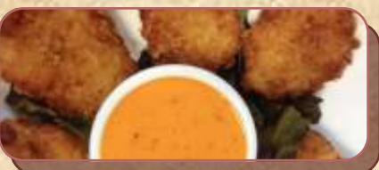
Panko Breaded Shrimp $1.25 per piece