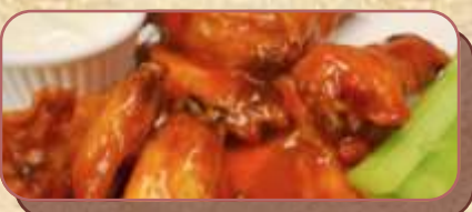
Wings Original Buffalo, Old Bay, BBQ, Honey Old Bay Naked, Sesame Teriyaki Lemon Pepper, Thai Chili & Caribbean Jerk $1.00 per piece