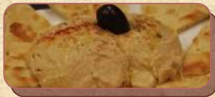
Hummus $11.95 Pint (6-8 servings) $25.95 Quart (15-20 servings)