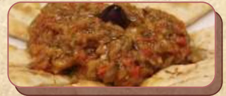
Roasted Eggplant Dip $11.95 Pint (6-8 servings) $25.95 Quart (15-20 servings)