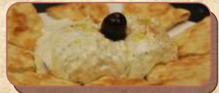
Tzatziki $11.95 Pint (6-8 servings) $25.95 Quart (15-20 servings)