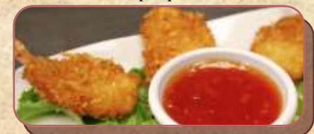
Coconut Shrimp $1.25 per piece