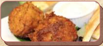
Falafel Balls $1.75 per piece (1.5 oz)