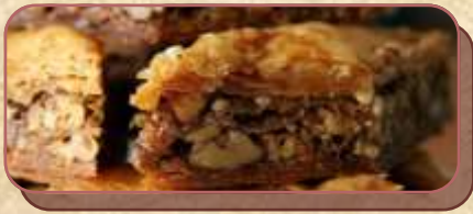
Homemade Baklava $1.95 per triangle