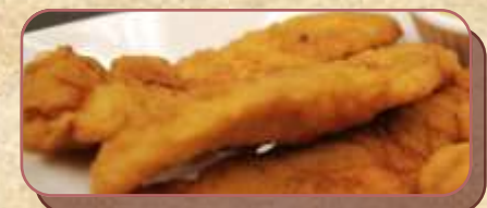
Chicken Tenders $1.95 per piece