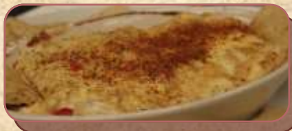
Crab Dip 39.00 per tray (up to 10 servings)