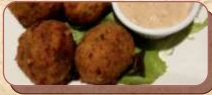
Potato Fritters $1.00 per piece