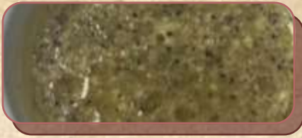
“Greek” House Vinaigrette

Homemade Dressings—$4.95 per pint / $9.95 per quart