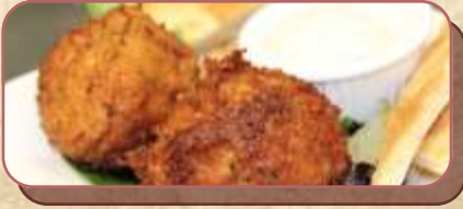
Falafel Balls $1.50 per piece (1.5 oz)