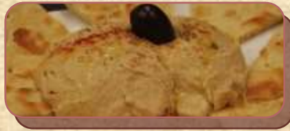
Hummus $10.95 Pint (6-8 servings) $24.95 Quart (15-20 servings)