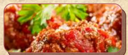
Meatballs (1/2 oz) Greek Style (mint & garlic) Italian Style (marinara) $0.50 per piece