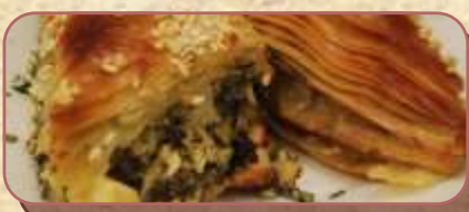
Spanakopita $2.95 per piece