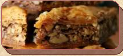
Homemade Baklava $1.95 per triangle