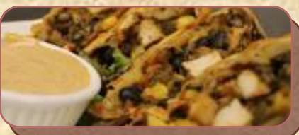
Southwest Egg Rolls $1.75 per piece