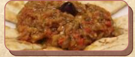
Roasted Eggplant Dip $10.95 Pint (6-8 servings) $24.95 Quart (15-20 servings)