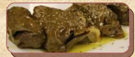
Dolmades $0.75 per piece